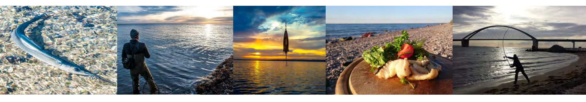
Photo competition Sustainable recreational fishing at the South Baltic coast

Discover the South Baltic Region as an interesting and attractive destination for recreational fishing and sustainable tourism!